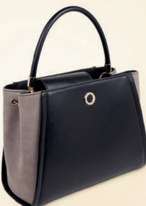
Alix lady bag black CTX334A