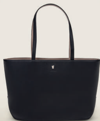
Mademoiselle lady bag black FTX322A