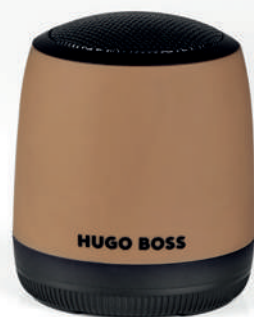
Gear speaker camel HAE007X