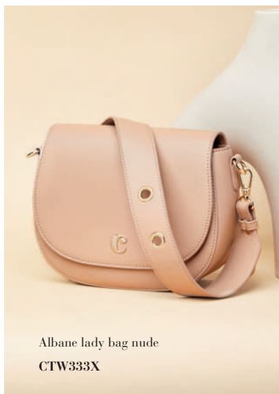
Albane lady bag nude CTW333X