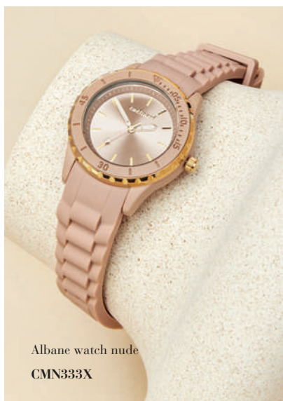
Albane watch nude CMN333X