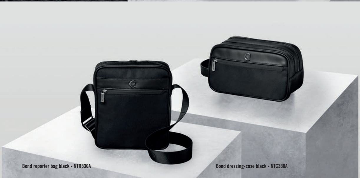
Bond reporter bag black - NTR330A