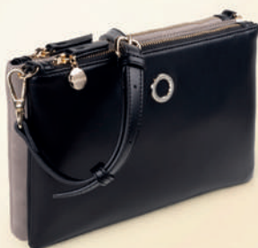
Alix lady bag black CTW334A