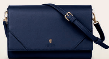
Mademoiselle lady bag navy FTW322N