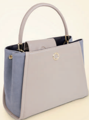
Alix lady bag nude CTX334X