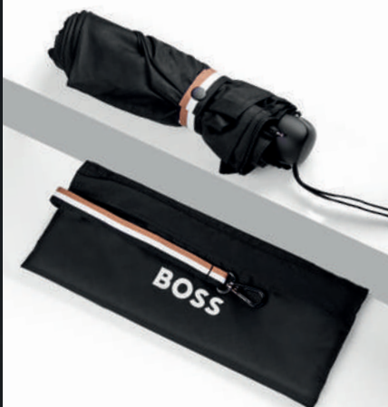
Iconic umbrella mini black HUG321A