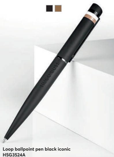
Loop ballpoint pen black iconic HSG3524A