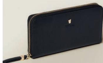
Mademoiselle travel wallet black FEL222A