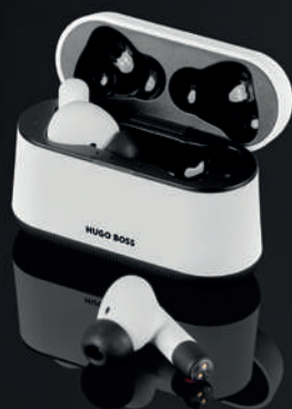
Gear Matrix earphones white-s HAP107W-S