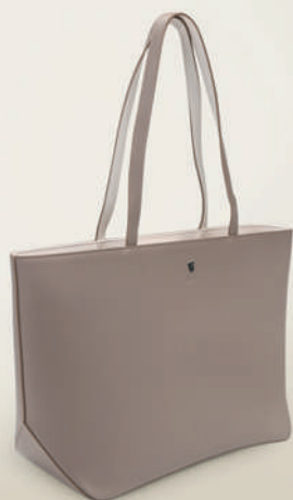
Mademoiselle lady bag beige FTX322X