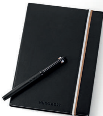
Set Iconic notebook A5 & Loop rollerball pen HPHR352A