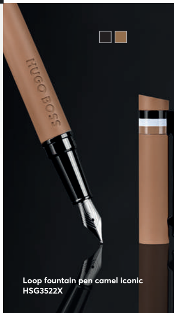
Loop fountain pen camel iconic HSG3522X