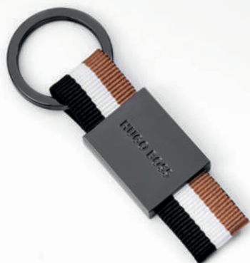
Iconic key ring style HAK385D