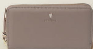
Mademoiselle travel wallet beige FEL222X