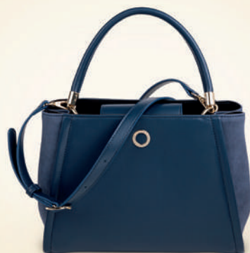
Alix lady bag navy CTX334N