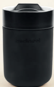
Alix isothermal flask black CAI334A