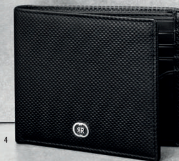
4. Regent wallet black - NLW329A