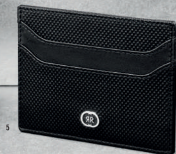
5. Regent card holder black - NLC329A