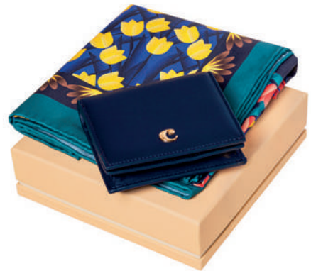
Set Albane lady wallet & Albane scarf - CPLL333N

The Albane handbags & wallets are the perfect everyday accessories. Their soft textures & golden signature have a resolute luxury feel. Available in 4 vibrant tones: Navy, Yellow, Brown or Nude, these items are perfect to mix & match with the eponymous scarves and watch to create colorful gift sets.