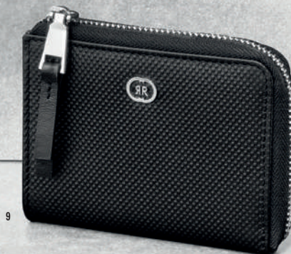
9. Regent card holder black - NLE329A