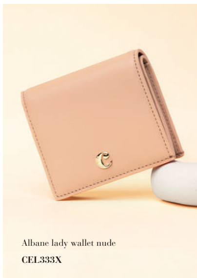
Albane lady wallet nude CEL333X