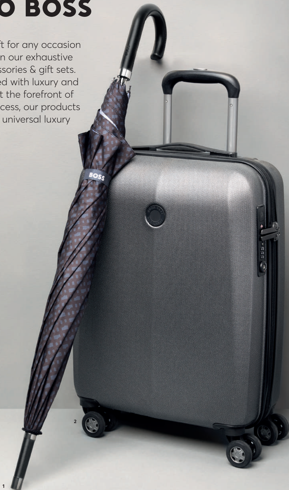
1. Monogramme umbrella dark grey - HUN310J 2. Gleam trolley - HTT105J

The perfect gift for any occasion can be found in our exhaustive range of accessories & gift sets. Each developed with luxury and functionality at the forefront of the design process, our products are unique yet universal luxury essentials.