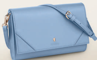
Mademoiselle lady bag light blue FTW322M