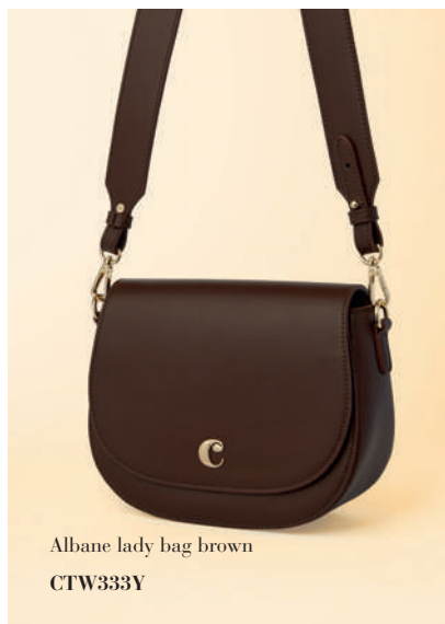
Albane lady bag brown CTW333Y