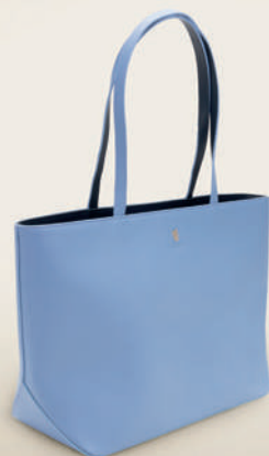
Mademoiselle lady bag light blue FTX322M