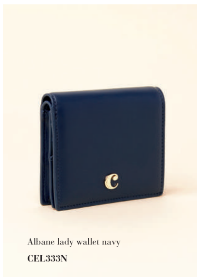
Albane lady wallet navy CEL333N