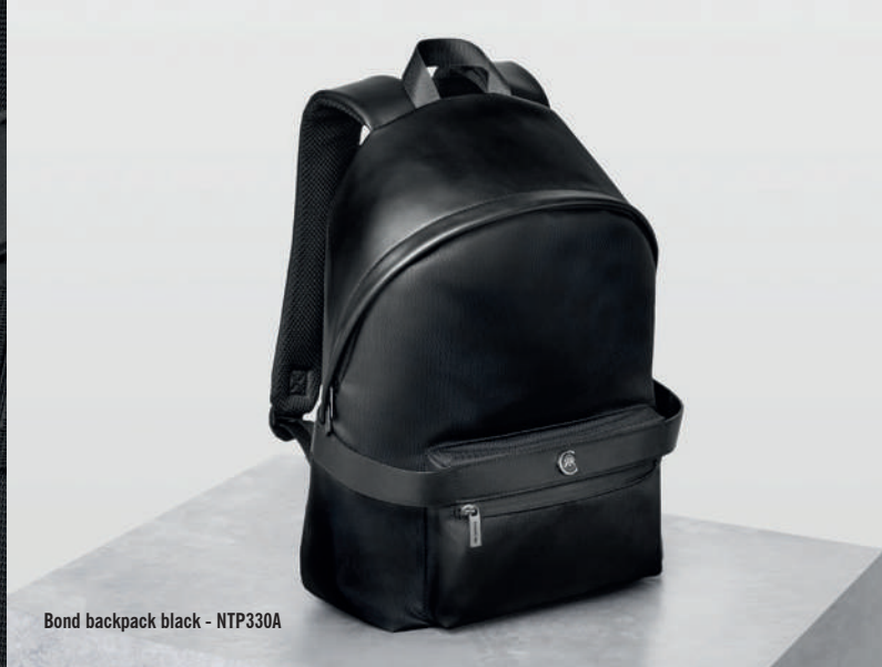
Bond backpack black - NTP330A