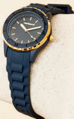
Albane watch navy CMN333N