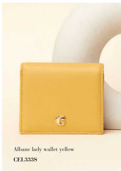
Albane lady wallet yellow CEL333S