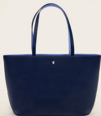
Mademoiselle lady bag navy FTX322N