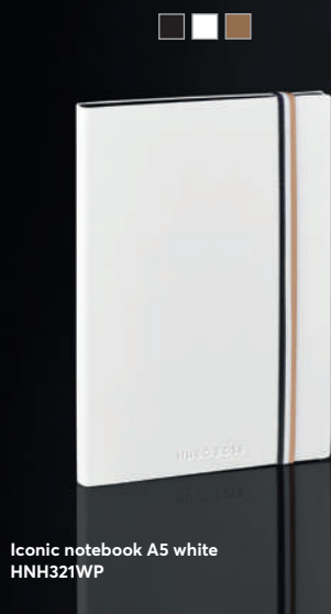
Iconic notebook A5 white HNH321WP