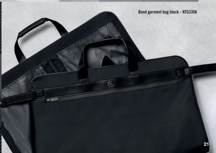
Bond garment bag black - NTG330A