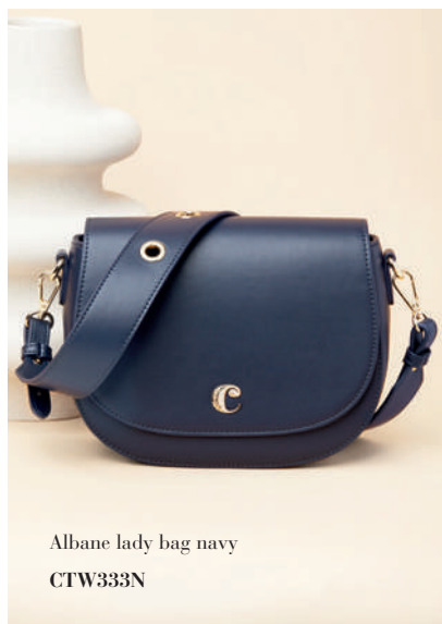
Albane lady bag navy CTW333N