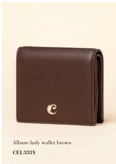
Albane lady wallet brown CEL333Y