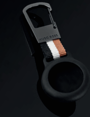
Iconic key ring with airtag holder HAA363D