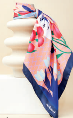
Alix scarf navy CFM334N