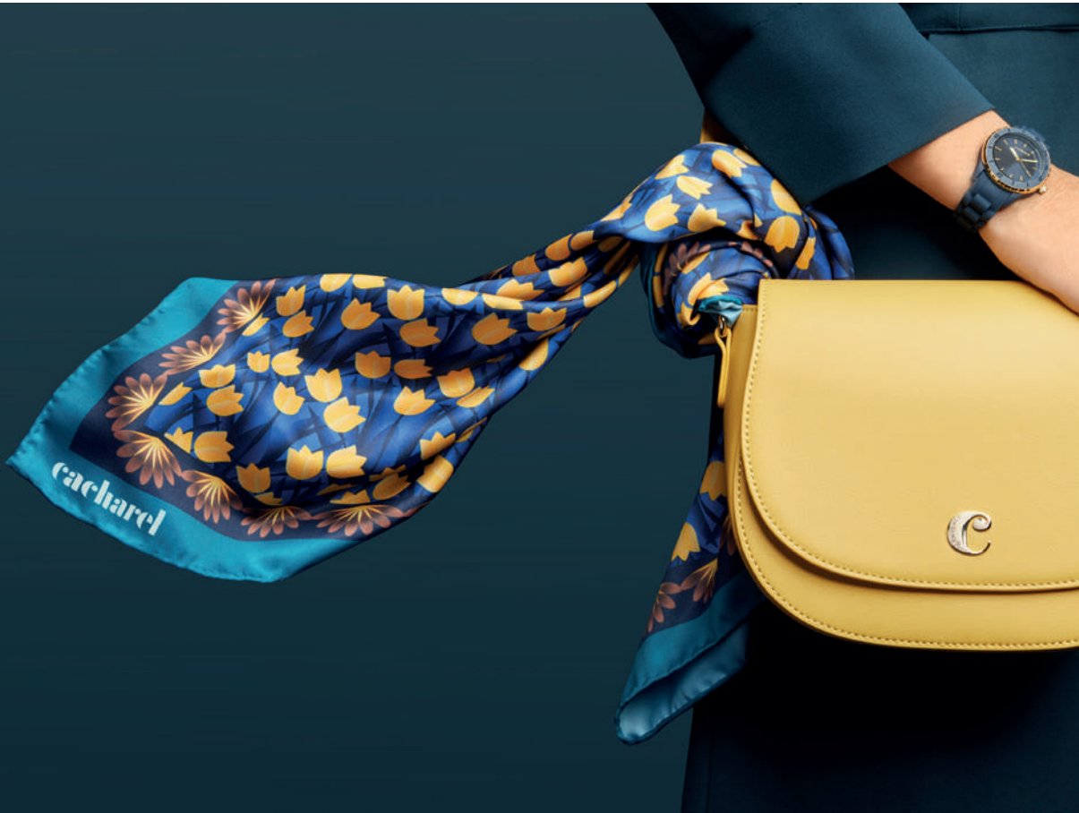
Albane scarf green - CFL333T