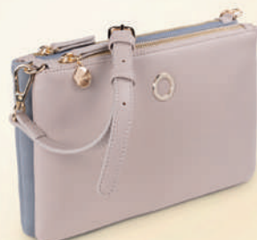
Alix lady bag nude CTW334X