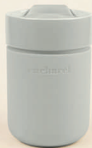
Alix isothermal flask grey CAI334K