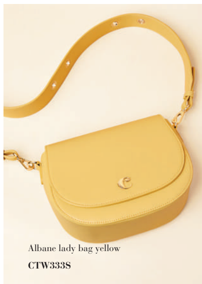
Albane lady bag yellow CTW333S